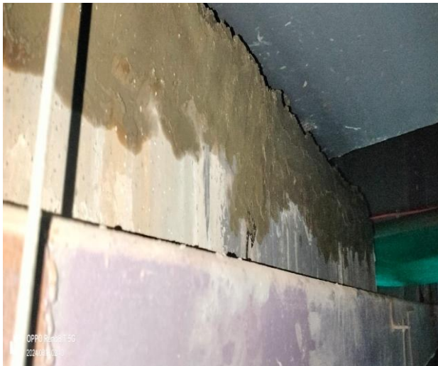
Figure 3: Deterioration due to water seepage

Water logging caused by leakage at the expansion joint in an elevated metro bridge is a critical concern. During the rainy season, water collects around expansion joints that have been damaged or sealed inadequately and starts to leak out of them. Leakage water drips to the ground, causing water to log on the roads, pathways, and even public places located under the bridges. Continuous leaking of water on road surfaces results in slippery road surfaces and traffic hazards such as lack of visibility, which increases the probability of accidents.