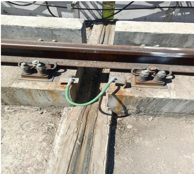
Figure 1: Expansion Joint in Metro

seepage water to reduce structural deterioration and improve public safety.